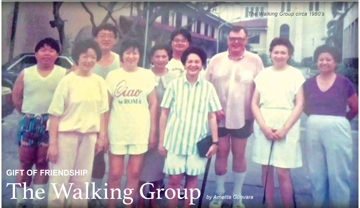
The Walking Group circa 1980's