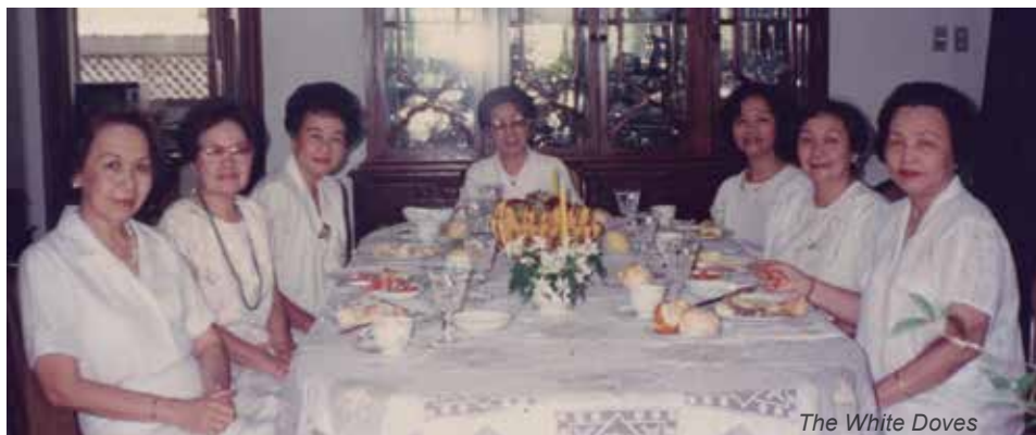
The White Doves