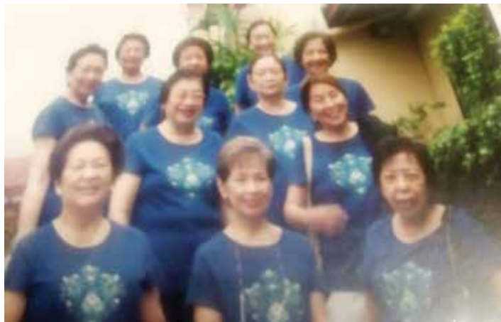
We have different colors each day to be in tune with the Earth. Blue is for Friday.

But while the activity has changed, what has endured is our friendship. We may disagree on many matters – and that makes our conversations every morning very spirited and interesting – but what binds us is our love of God and His Church.