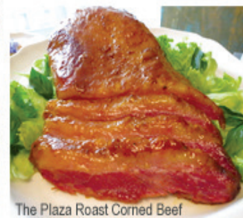
The Plaza Roast Corned Beef