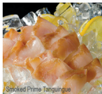
Smoked Prime Tanguingue

Available at PETRON SQUARE DASMARINAS or call 729.0001 | 890.8446