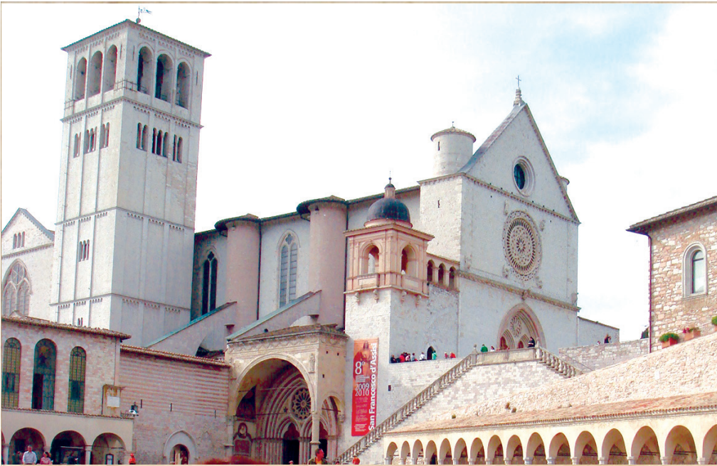
The Basilica of St. Francis in Assisi