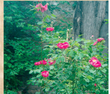
Pink and fuchsia pink thorn-less roses