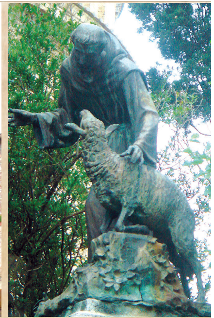
Statue of St. Francis and the sacrificial lamb in bronze