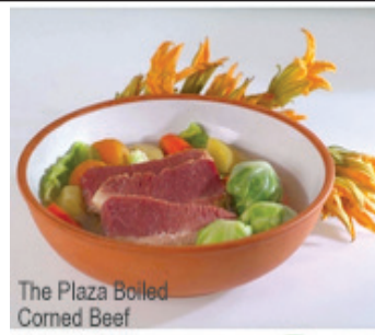
The Plaza Boiled Corned Beef