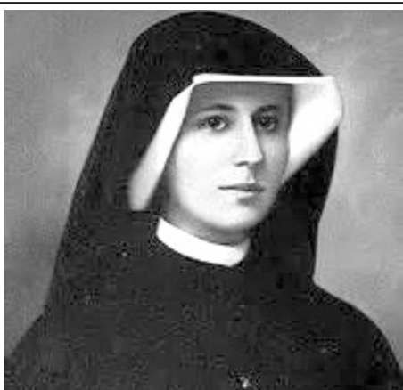
St. Faustina Kowalska celebrates her feast day on Oct. 5. St. Faustina's name is linked to the annual feast of the Divine Mercy (celebrated on the Second Sunday of Easter), the divine mercy chaplet and the divine mercy prayer recited each day at 3 p.m. by many people.