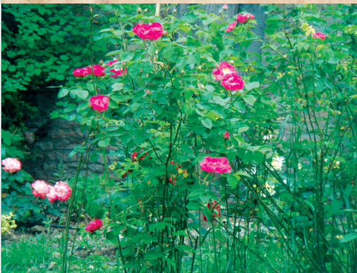
The thorn-less roses in Assisi