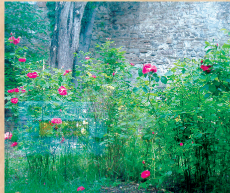
Thorn-less roses growing in Assisi